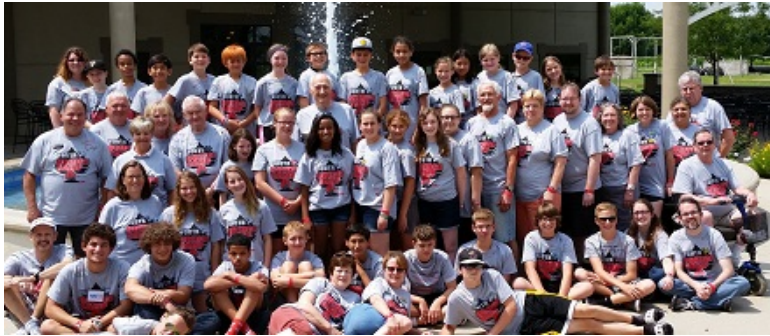
2015 Youth Bridge Campers & Staff

Welcome to the Gateway to the West Regional!